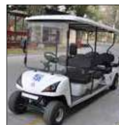
Golf Cart Charged Through Developed Charging Station