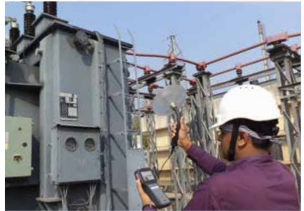
Online Partial Discharge Testing