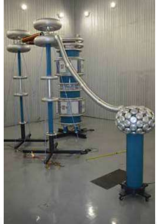
High Voltage Partial Discharge Laboratory