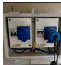
Charging Station Installed at ERDA