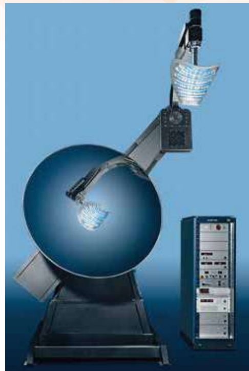
Type 'C' Goniophotometric Laboratory