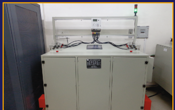
Electric Endurance Test Setup

ELECTRICAL RESEARCH AND DEVELOPMENT ASSOCIATION