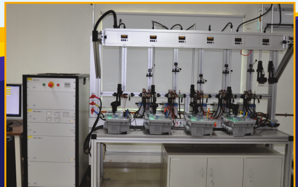
DLMS Compatible Automatic Test Bench